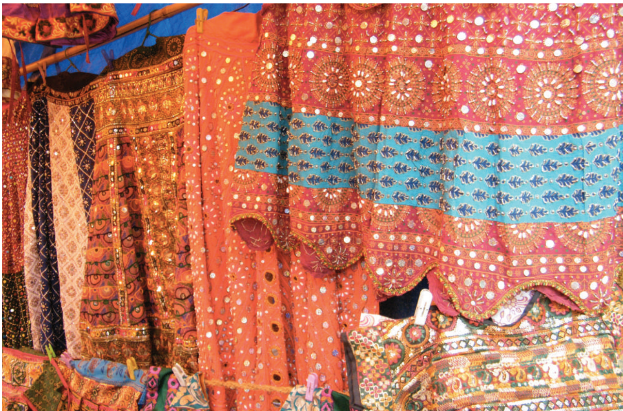
Indian crafts are facing winds of change