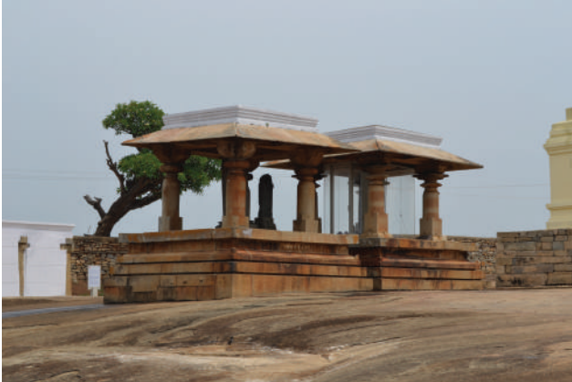
The twin towers are memento pillars raised in honour of the dead