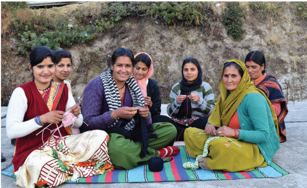
The happy members of Himalayan Blooms, an all-women social enterprise

MKR has been allotted two large rooms in Pune by the state government, where it plans to start a library with over 2,000 books in June 2018. This library is the start of sensitising widows and educating them about their rights. MKR aims to provide knowledge about the world strong women leaders of the society, and create awareness about the potential each woman has through books, human library sessions, and storytelling methods. Alongside, MKR will train widows in vocational skills like tailoring, stitching, etc.