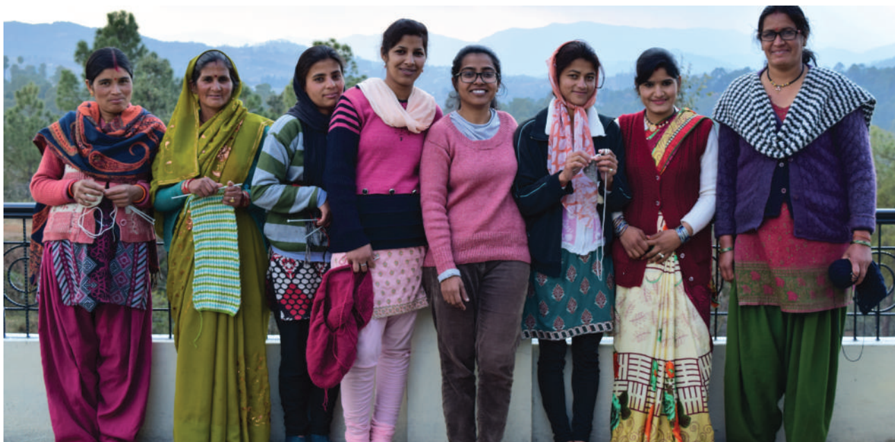
These hill women have become massively empowered