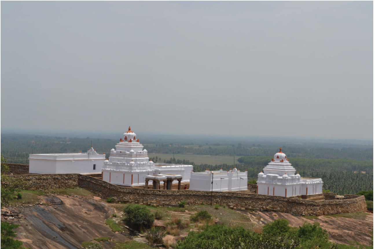
The basadis of Chandragiri