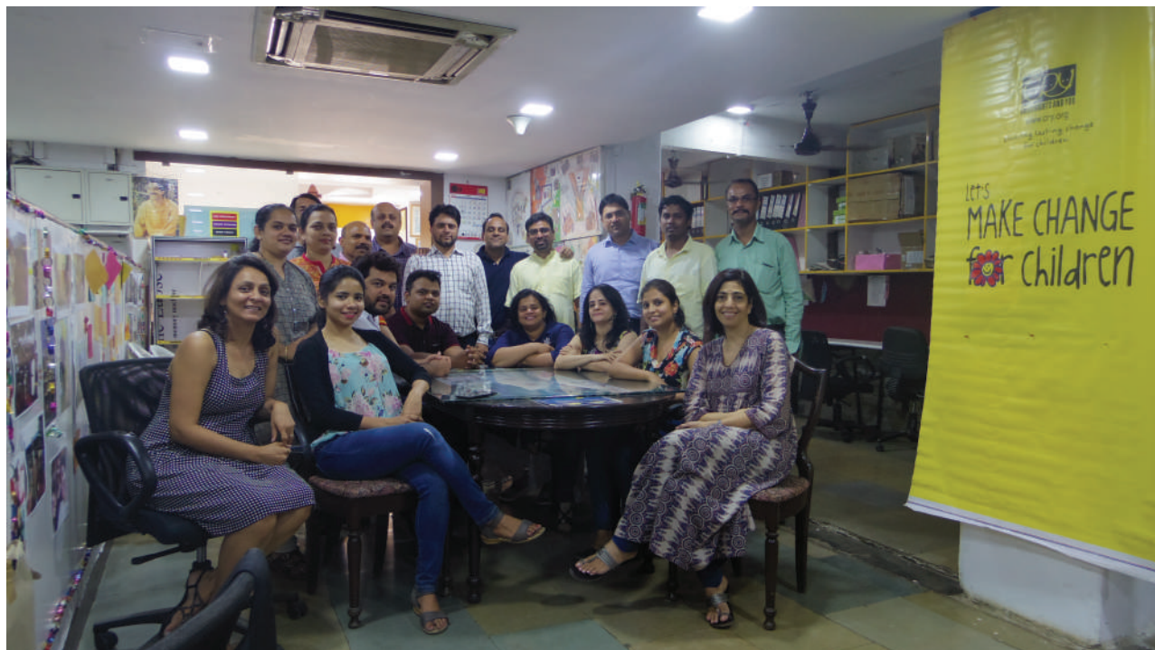
Team CRY; they have redefined the role of the NGO in India