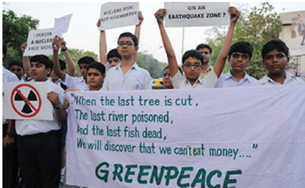
NGOs should be audited for better accountability