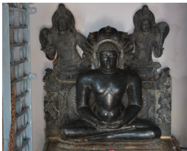
An idol of one of the Jain Tirthankaras

As you move upwards you will find the sacrifice pillar or what is known as Thyagada Khamba. It is a four-pillared small structure with an upper storey at the top. The pillar was erected in memory of minister Chavundaraya, who gave generous gifts to the poor. Another version is that Chavundaraya renounced everything here, and hence the name sacrifice or Thyaga in local language. A yaksha image can be spotted on the top of a pillar.