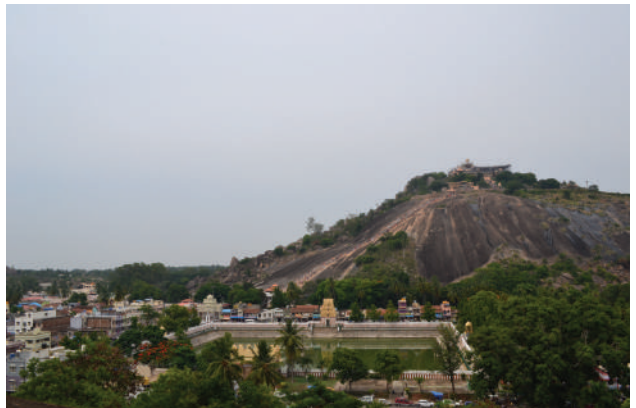
A view of the Vindhyagiri Hill

Getting there: Chandragiri and Vindhyagiri Hills are located in Shravanabelagola town near Channarayapatna of Hassan district. Buses and trains are available to the town from Bangalore city. Taxis too are available from the city, and will normally take around four hours to reach the place. There are plenty of hotels en-route the Bangalore-Hassan Highway.