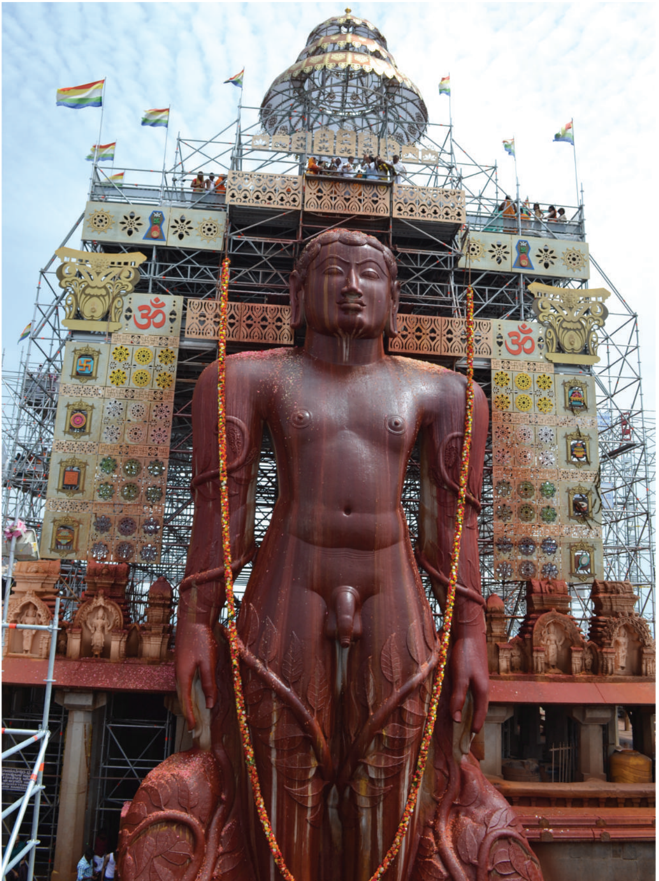
The monolithic statue of Gomateshwara, considered one of the largest which exists.