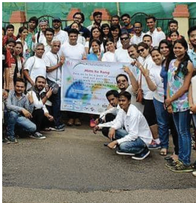
The young team of Mitti Ke Rang, truly dedicated