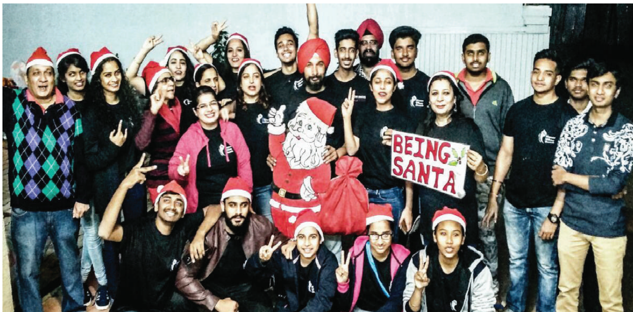
The core team members of Manav Uthal Manch, a community NGO of Nashik