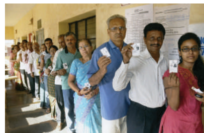
Citizens indeed have power!

Most pollsters had predicted that the polls would throw up a fractured verdict, but one or two had predicted that the BJP would get a majority on its own. Elections were countermanded in one constituency due to the death of the BJP candidate, and deferred in another after thousands of voter ID cards were found in a flat. The final tally was 104 for the BJP, 78 for the Congress and 38 for the JD (S) (actually 37 as H.D. Kumaraswamy won from both his constituencies). The Governor, Vajubhai Vala, an old RSS hand and former Gujarat minister, exercised his discretion and invited the single largest party, the BJP to form the government, though he was fully aware that the party was short of a majority by eight, and the only way it could get the numbers was through unethical means like horse trading. He also magnanimously allowed the BJP's CM B.S. Yeddyurappa, whom he had sworn in by then, 15 days to prove his majority on the floor of the house, though the CM had only requested for seven days. But the BJP was in for a rude shock as the Supreme Court, hearing a petition by the Congress, trimmed the period from 15 days to just 24 hours. Caught unawares and unable to launch its second version of Operation Lotus to wean away