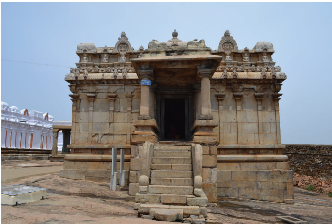
The Chavundaraya Basadi