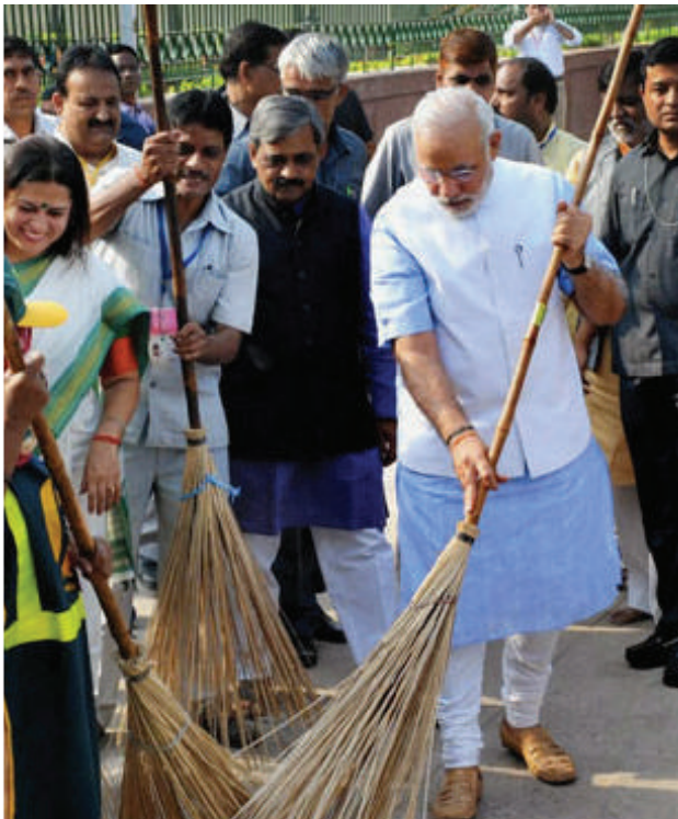
With the Prime Minister leading the way, civil society needs to buck up

A country which has NGOs more than the number of schools or hospitals is still low on its social indices, and a majority of its region is backward. This makes me think of the gaps that the development sector has when it comes to NGOs and their working pattern. Speaking to a few active members in the development sector, I have come across three issues that have delayed processes and development as a whole.