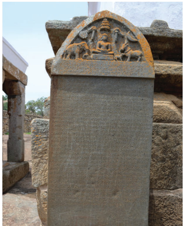
The inscriptions on the basadis talk about Sallekhana by Jain Devotees

When Chandragupta Maurya was the King of Pataliputra he had vivid dreams. One night he dreamt of setting sun, black elephants fighting, a 12-headed serpent approaching, etc. Disturbed by the dreams, the king discussed this with a Jain Acharya, Shrutakevali Bhadrabahu. Bhadrabahu Muni predicted a gloomy future and also forecast a 12-year famine in the area. Thus the Muni and his disciples decided to migrate. Bhadrabahu along with 12,000 followers and the Mauryan Emperor shifted south. When Bhadrabahu reached Katavapra he realised that his end was approaching and so he asked his disciples to move