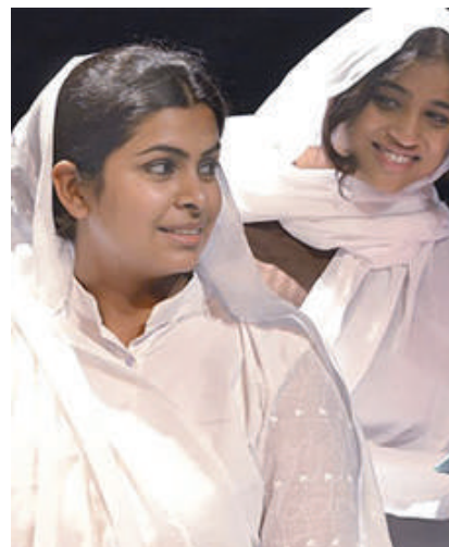
A still from the play