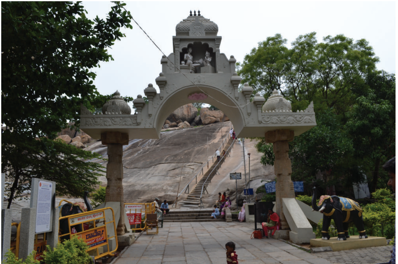
Chandragiri, the oldest Jain pilgrimage centre in South India