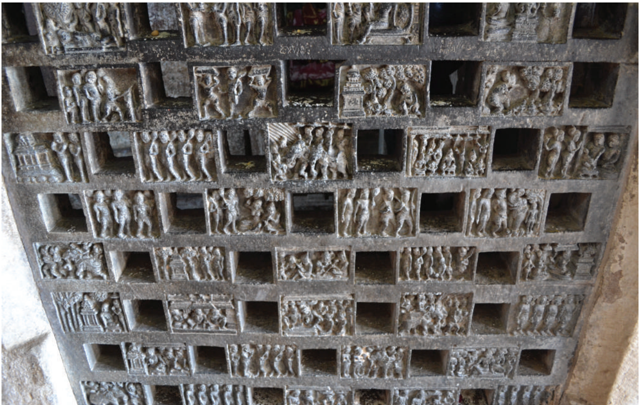
The relief panel at the Chandragupta Basadi, which describes Bhadrabahu muni 's migration to the South

As you exit the courtyard, you can check the Bhadrabahu Cave on the left. There are plenty of benches to help you relax. Signboards are plenty inside the courtyard, and will help you understand the significance of this place better. Take note that you will have to remove your footwear before climbing the steps. This is a pilgrimage centre and hence wearing shoes while climbing is not permitted.