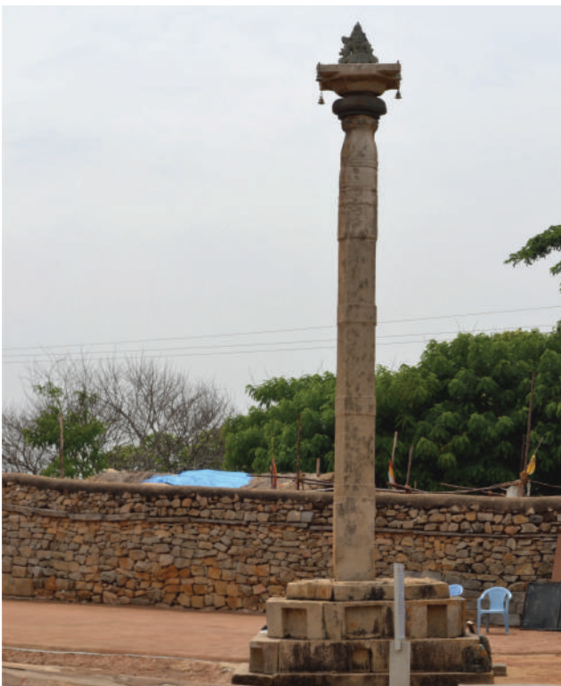
The Marasimha Manastambha, constructed in honour of the Ganga king, Marasimha

further south. The Guru along with Chandragupta Maurya remained back and resided at a cave atop the hill. He observed Sallekhana, and after his death, Chandragupta remained at Chandragiri worshipping the footprints of Bhadrabahu. The cave is still present with the footprints etched inside the cave.