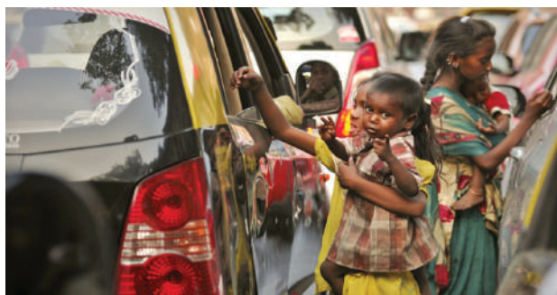
Do NGOs have a big role to play in poverty alleviation?

to accept foreign funds since Prime Minister Narendra Modi took office in 2014. George Soros's Open Society Foundations, and the National Endowment for Democracy, too were barred from transferring funds without permission from Indian security officials.