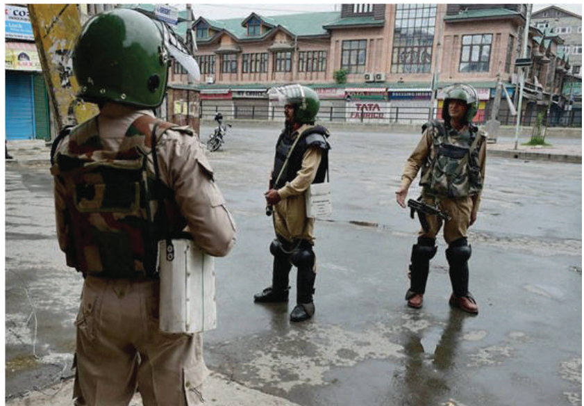
A common scene in Kashmir

The army's deployment in the state is for two distinct tasks. Firstly, ensure the sanctity of the Line of Control (LoC), which includes free flow on its lines of communications, and secondly, to assist the civil administration in neutralising the terrorists and insurgents, so that violence is